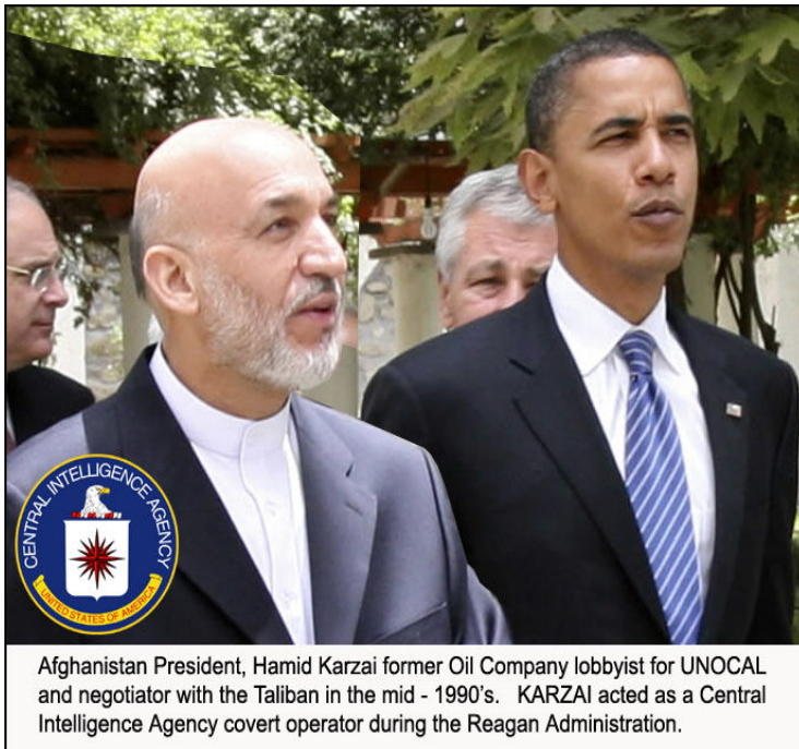
Afghanistan President, Hamid Karzai former Oil Company lobbyist for UNOCAL and negotiator with the Taliban in the mid - 1990's. KARZAI acted as a Central Intelligence Agency covert operator during the Reagan Administration.